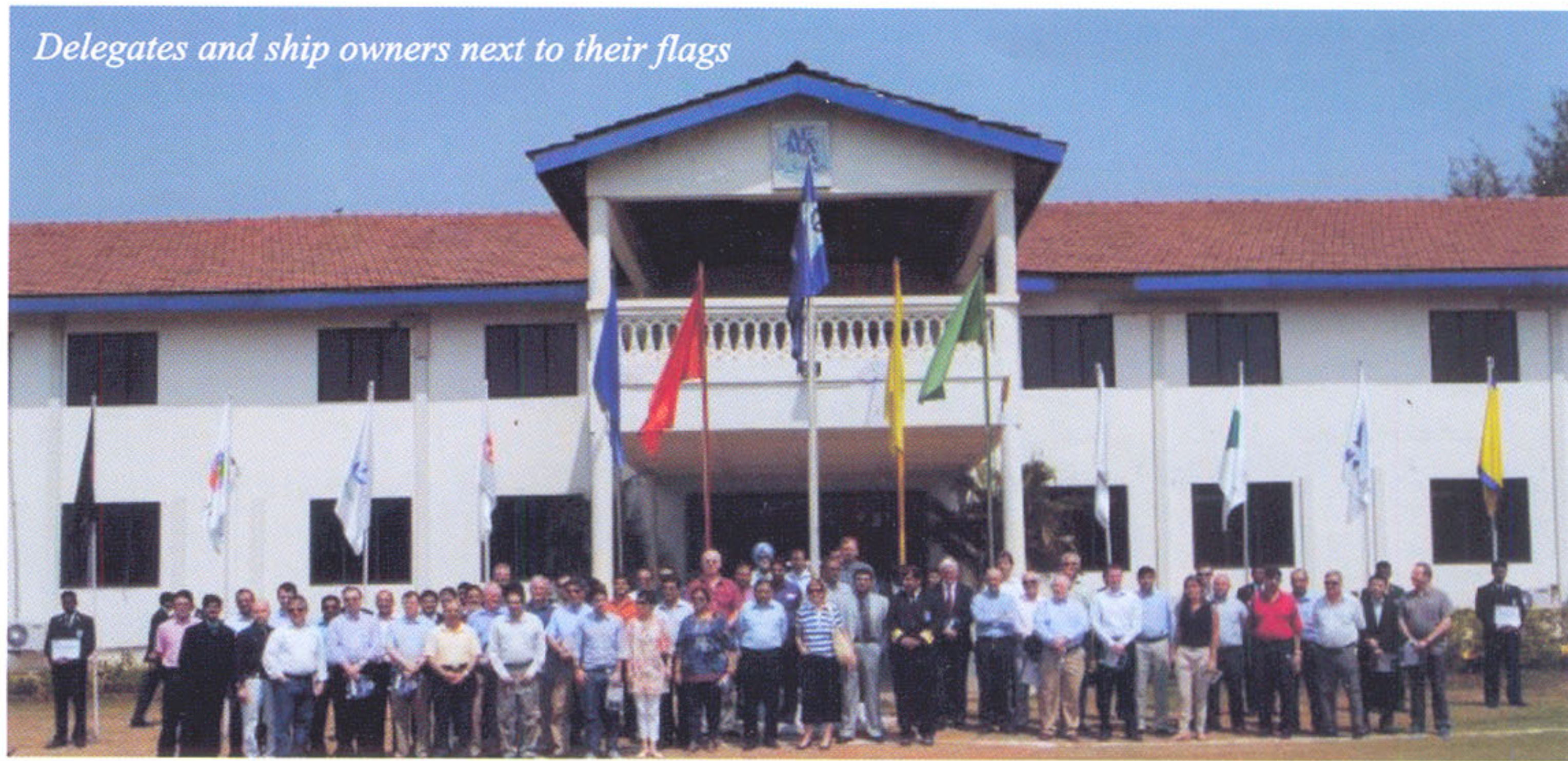
Delegates and ship owners next to their flags

dedicated, hard working and loyal. These qualities, he added had to be inculcated from the early training stage.. He stressed that AEMA, like its parent group, had a responsibility of imbibing the cherished values of professionalism, honesty and transparency.