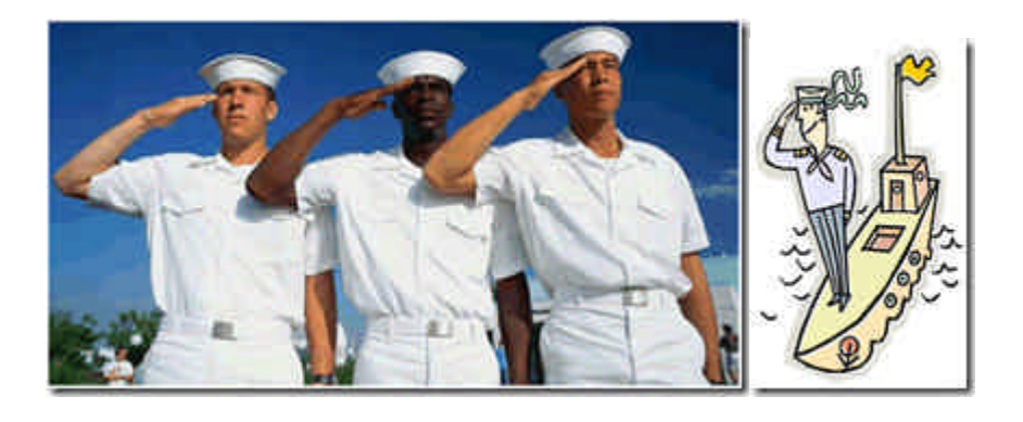
10 Reasons Why Navy Uniforms are White

A quick thinking on "Why Navy Uniforms are White?", gave me some logical and funny reasoning.